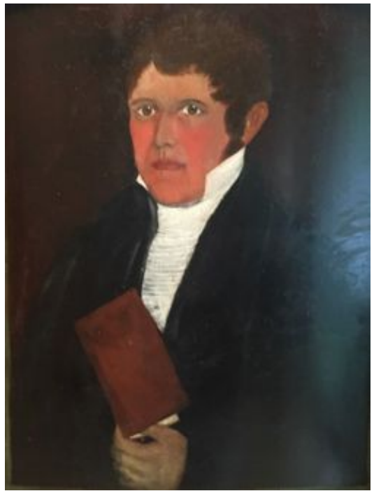
4 Erastus Wood House